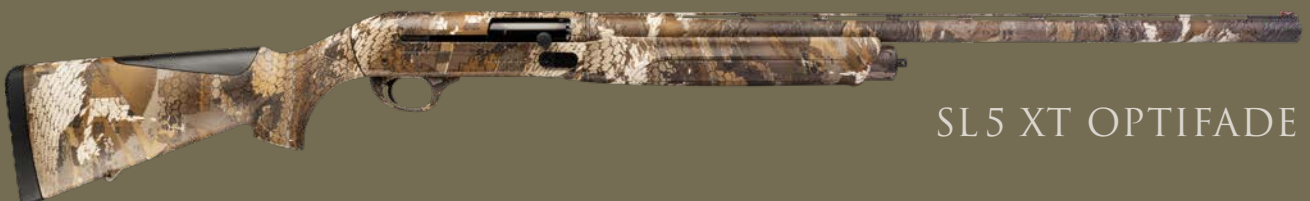
SL5 XT OPTIFADE